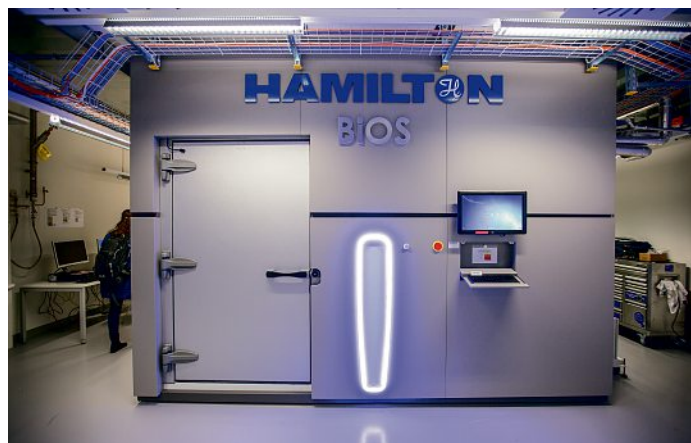
The Hamilton BIOS system installed at the Inselspital in Bern allows biological samples to be stored at -80\text{ }^{\circ}\text{C} . The system fully automates the handling of the sample, including its storage, retrieval and inventory.

“The hospital-integrated Biobank Bern Liquids was recently inaugurated and, together with the Institute of Pathology of the University of Bern, forms the Biobank Bern, offering exceptional sample quality, fully automated pre-analytical processes, and robotized storage at -80\text{ }^{\circ}\text{C} and < -130\text{ }^{\circ}\text{C} ”, explains Alexander B. Leichtle , MD, Consultant for Sample and Report Management