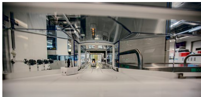
Laboratory tour of Clinical Chemistry at the Inselspital Bern during the Thematic Platform IVD event on the 25 th of April 2016. Sample automation at the Inselspital in Bern. Blood samples of patients are tracked and transported, in a fully automated process, to the respective locations for analysis.

To ensure excellent scientific quality and a broad base of experience, an expert advisory board – consisting of seasoned professionals from industry and academia – monitors the activities of the steering committee of the Thematic Platform and contributes with know-how and guidance in the development and implementation of the strategy. The Thematic Platform’s mission is to promote technological innovation in in vitro Diagnostics (IVD) and to enable translational research from academia to